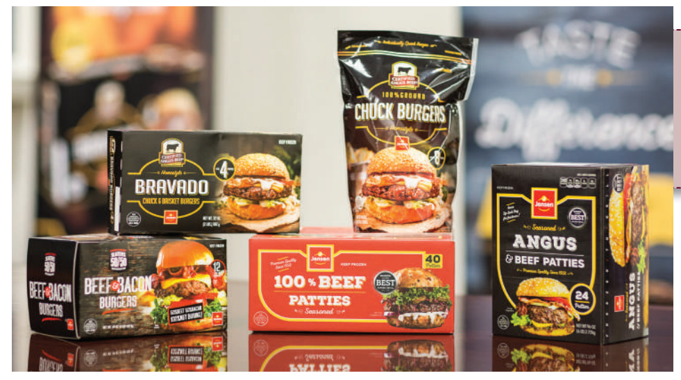
>> Jensen Meat invested $4 million in its facility last year and grew its business by 30 percent.